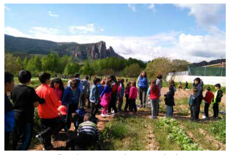
Engaging young people to restore land

In a town of a thousand inhabitants, this organization led by a 75year old lady, has succeeded in sowing hope not only in the fields but also in the lives of people that now feel they are part of a community.