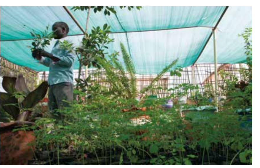
Community nursery in Wad Kota village

More information: http://bit.ly/2ulC9hE YouTube video: UN Wadi Partners