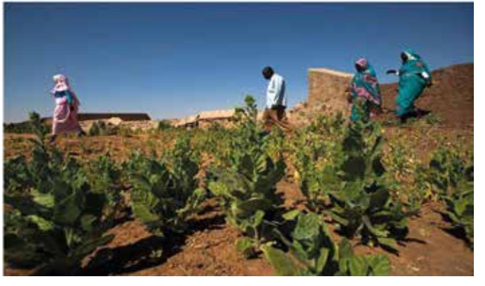
Agricultural yields are higher in the irrigated Wadi land

The Ecosystem-based Disaster Risk Reduction (ECO-DRR) programme in North Darfur, implemented in 2012 to 2015 as a pilot project by the UN Environment and its partner Practical Action Sudan to improve food security and disaster resilience.