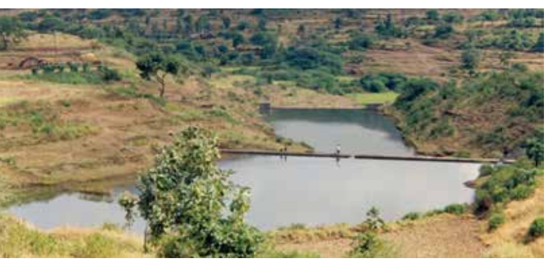
Water harvesting structures e.g. check dams were built in agriculture rain-fed areas