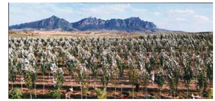
Restoration of desertified land in Xuanhua County, Hebei Province China